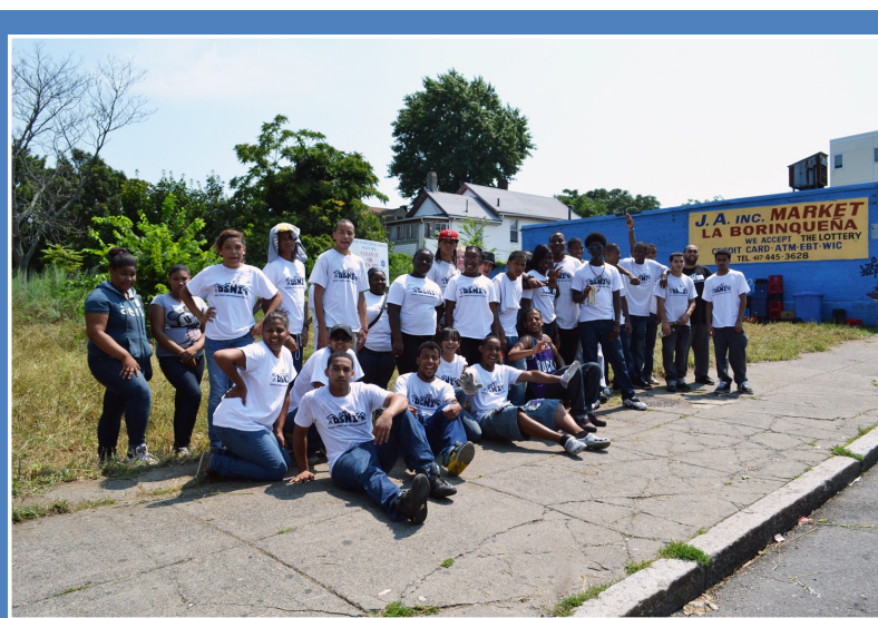
The DSNI Teen Summer Staff

DSNI employs teens from surrounding neighborhoods to organize, then execute, community projects that help individuals and the broader the community.